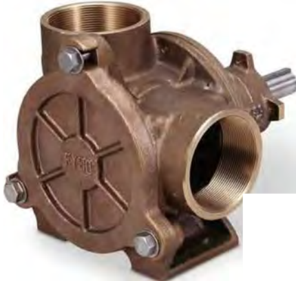
Model FY80 (pump unit)

Exceptional designed model for collection / transferring Seaweed, Fibrous material without raw material damage