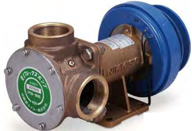
Model FP50 with electromagnetic clutch